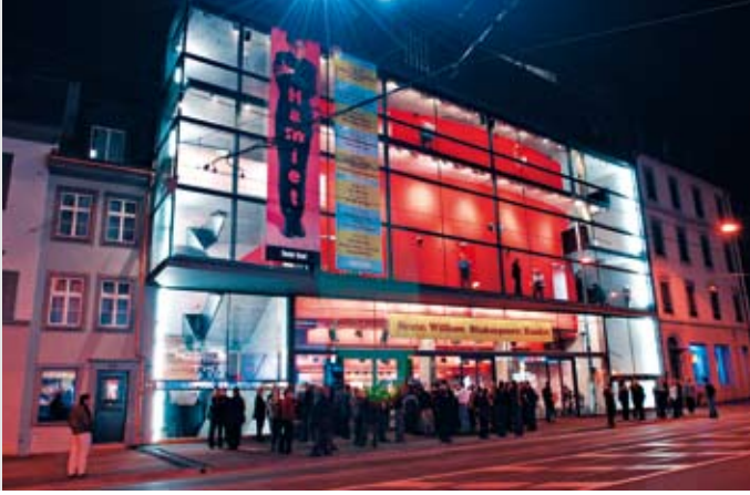
House of Spectacle

In record time, Roche has erected an ultramodern Biotechnikum that is not only one of the most advanced in the world, but also captivatingly beautiful. Furthermore, at its headquarters in Basel Roche is planning to build a huge, futuristically elegant office block to house 2,400 employees and a new research and development building. Both of these projects, involving a total investment of about CHF 800 million, will be designed by Herzog & de Meuron, a world-famous Basel architectural office.